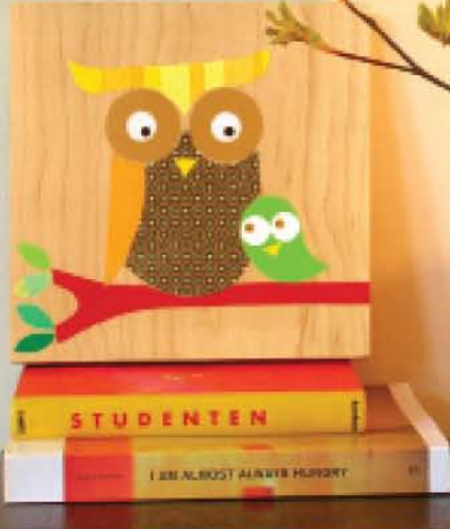
(text by katie freeman)