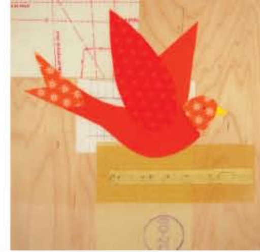
here birdie This calico bird collage gives new meaning to the word country craft.