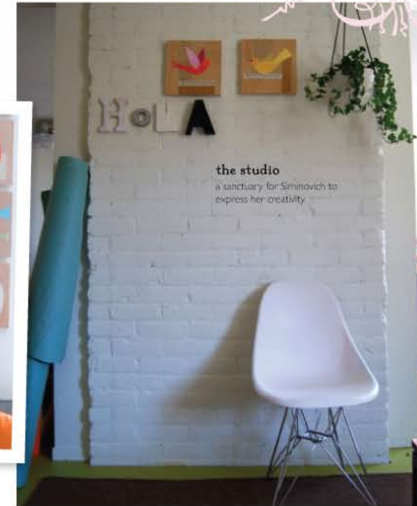
the studio a sanctuary for Siminovich to express her creativity